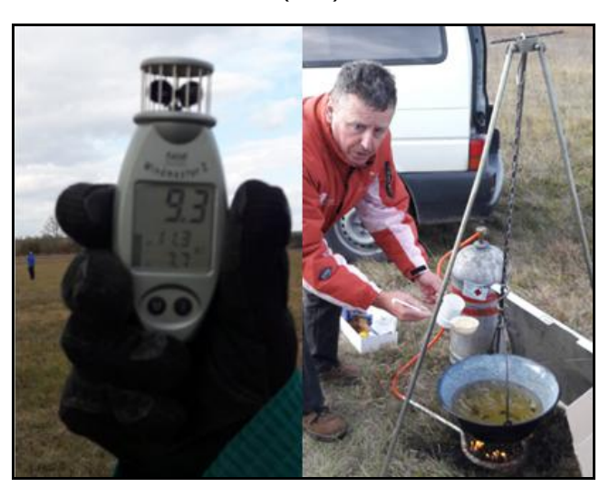
Herend CUP - strong wind, but good thermal by hot tea!