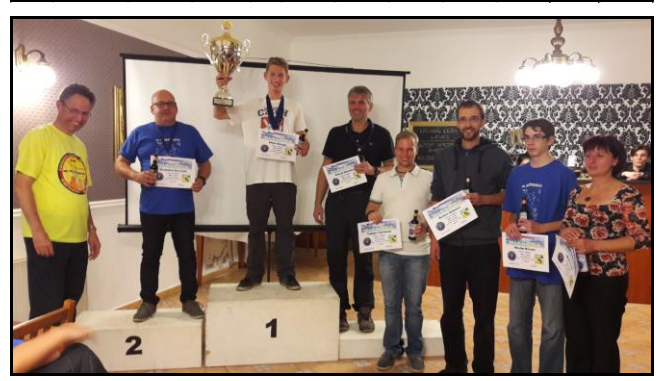
Happy HEC FLY OFF participants 2016